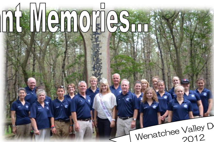
Wenatchee Valley Delegation 2012

Therefore, the Tohoku Taiko Liaison Council—composed by the Taiko Union in the 6 prefectures (Akita, Aomori, Fukushima, Iwate, Miyagi, and Yamagata) of the Tohoku region—is hosting this year’s festival as a “Regenerating Event”, to inspire many people and revitalize many local activities. Come out and show your support! The Taiko drum teams from the 6 prefectures of Tohoku are coming!